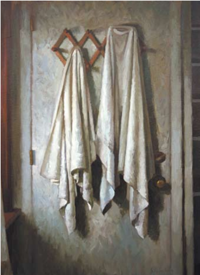
WHITE ON WHITE, OIL ON CANVAS, 24 X 18"

This manner of catching notice of something and feeling compelled to paint it is what marks much of Schulenburg’s work.