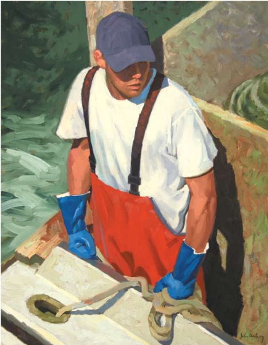
FINAL APPROACH, OIL ON CANVAS, 28 X 22"