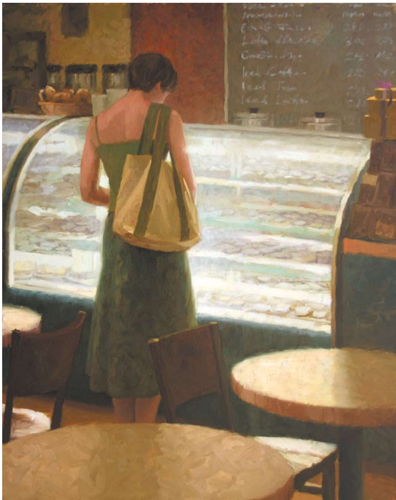
SWEET DECISION, OIL ON CANVAS, 30 X 24"