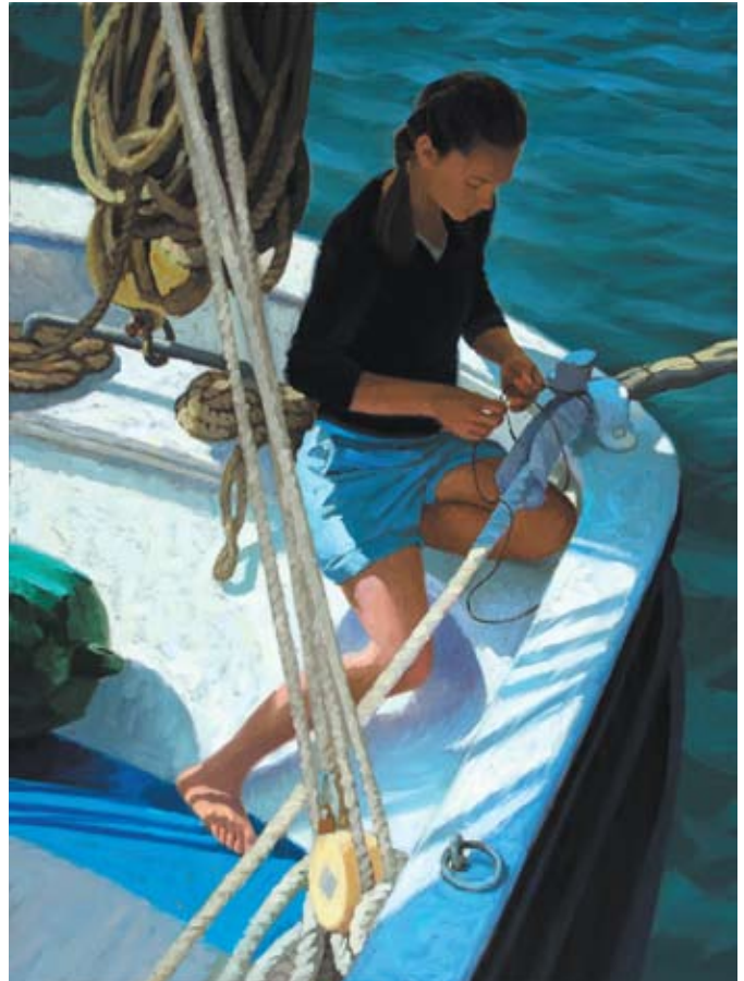
PROTECTING THE LINES, OIL ON CANVAS, 40 X 30"